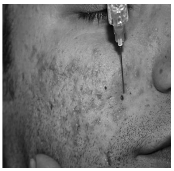
Figure 4.—Painless injection of hyaluronic acid by means of a 23-Gauge needle.