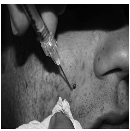
Figure 5.—Painless injection of hyaluronic acid by means of a 21-Gauge needle.

Immediately after the injection on each hemiface, the intensity of the overall tolerated pain was assessed for each individual patient by means of Scott-Huskisson VAS. All the patients completed the trial and no dropout, due to discomfort or pain, was recorded. The spontaneous pain sensation perceived by the patients in the hemiface treated with JetPeel<sup>TM</sup>-3carbocaine was significantly lower com-