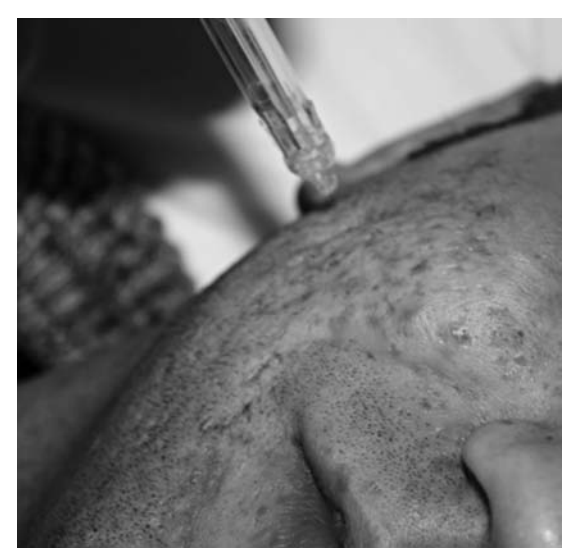
Figure 2.—Carbocaine perfusion by means of JetPeel<sup>TM</sup>-3.